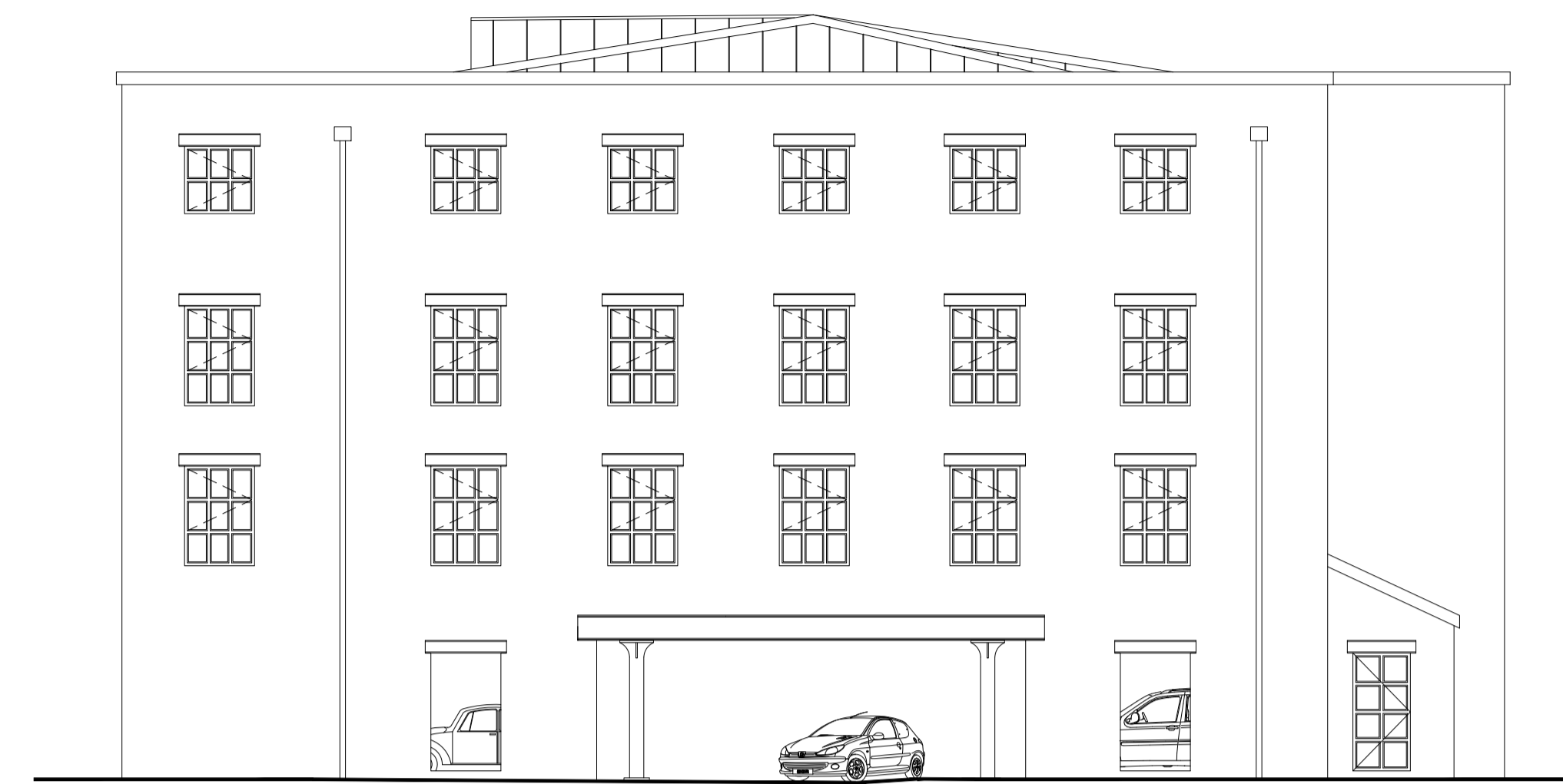
SIDE ELEVATION - (ELEVATION FACING WELLINGTON ROAD)