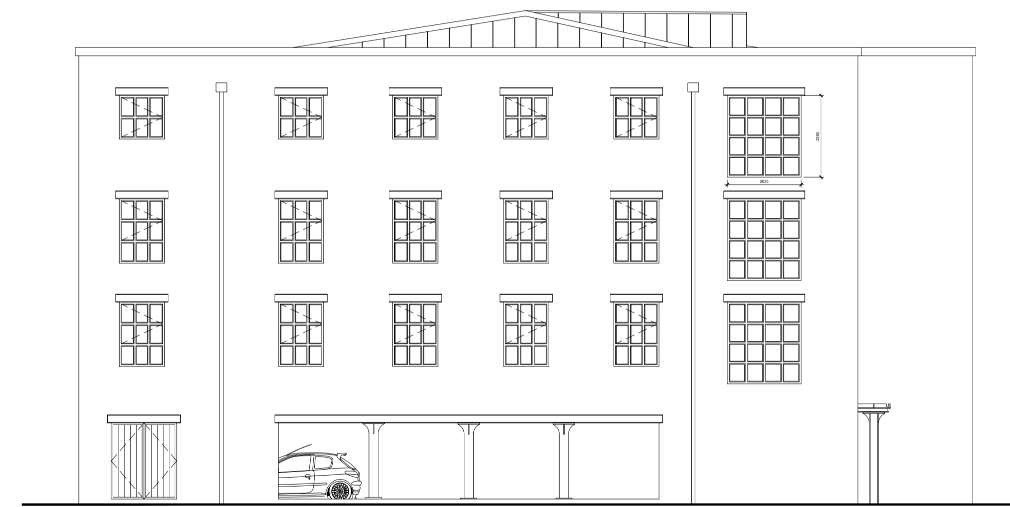
SIDE ELEVATION - (ELEVATION FACING WATERCOURSE)